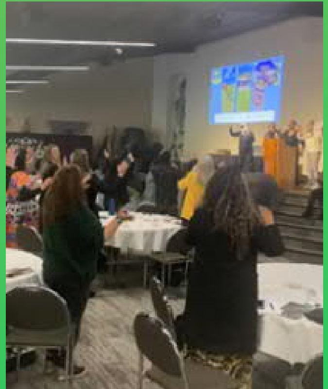
Photos from our recent Terenga 4 Graduation

Ngāti Whakaue Iho; Ngāti Whakaue Ake Ngāti Whakaue Tangata, Ngāti Whakaue Tikanga Te Taumata o Ngāti Whakaue Iho-Ake Te Puna Ora o te Iwi